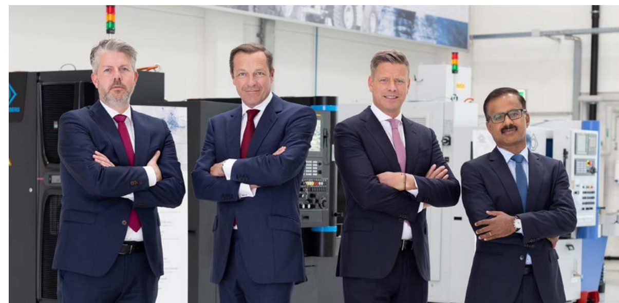
The Board of Directors of KLINGELNBERG Group.

We expect our business partners, in particular suppliers and agents, to also adhere to the principles set out here or to comparable standards. This Code of Conduct is an integral part of all our business relationships. The KLINGELNBERG Group reserves the right to verify compliance by our business partners based on evidence.